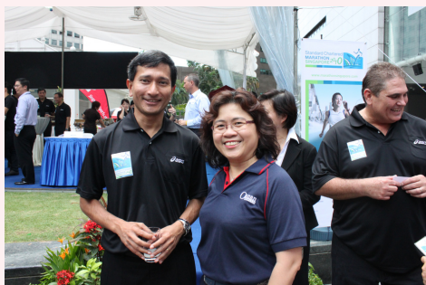
with Minister Vivian Balakrishnan at the 2010 Standard Chartered Marathon. Ocean Health was one of its sponsor.