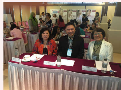
with other speakers at a medical aesthetic conference in Malaysia