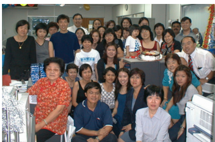
Ocean Health Team in the early days

raison d'être on setting up Ocean Health