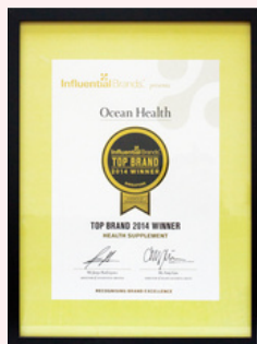
2014 Influential Brands Awards, one of multiple earned awards