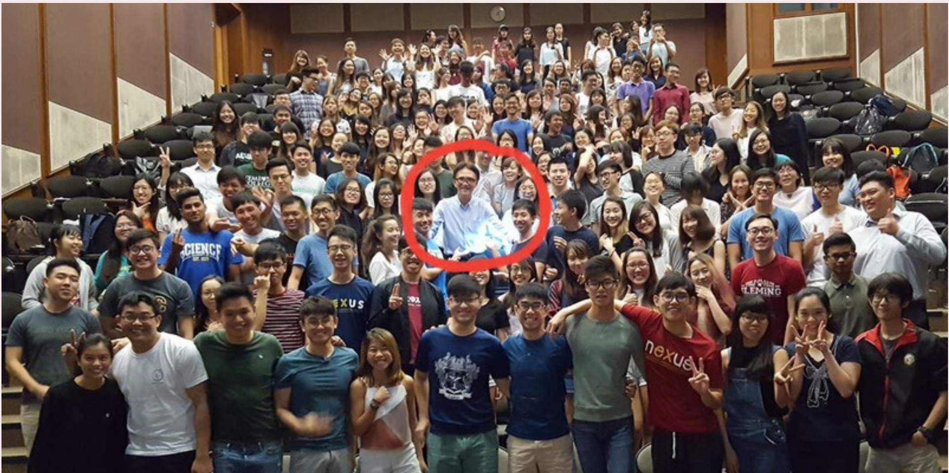
With pharmacy students at NUS LT29, 2018