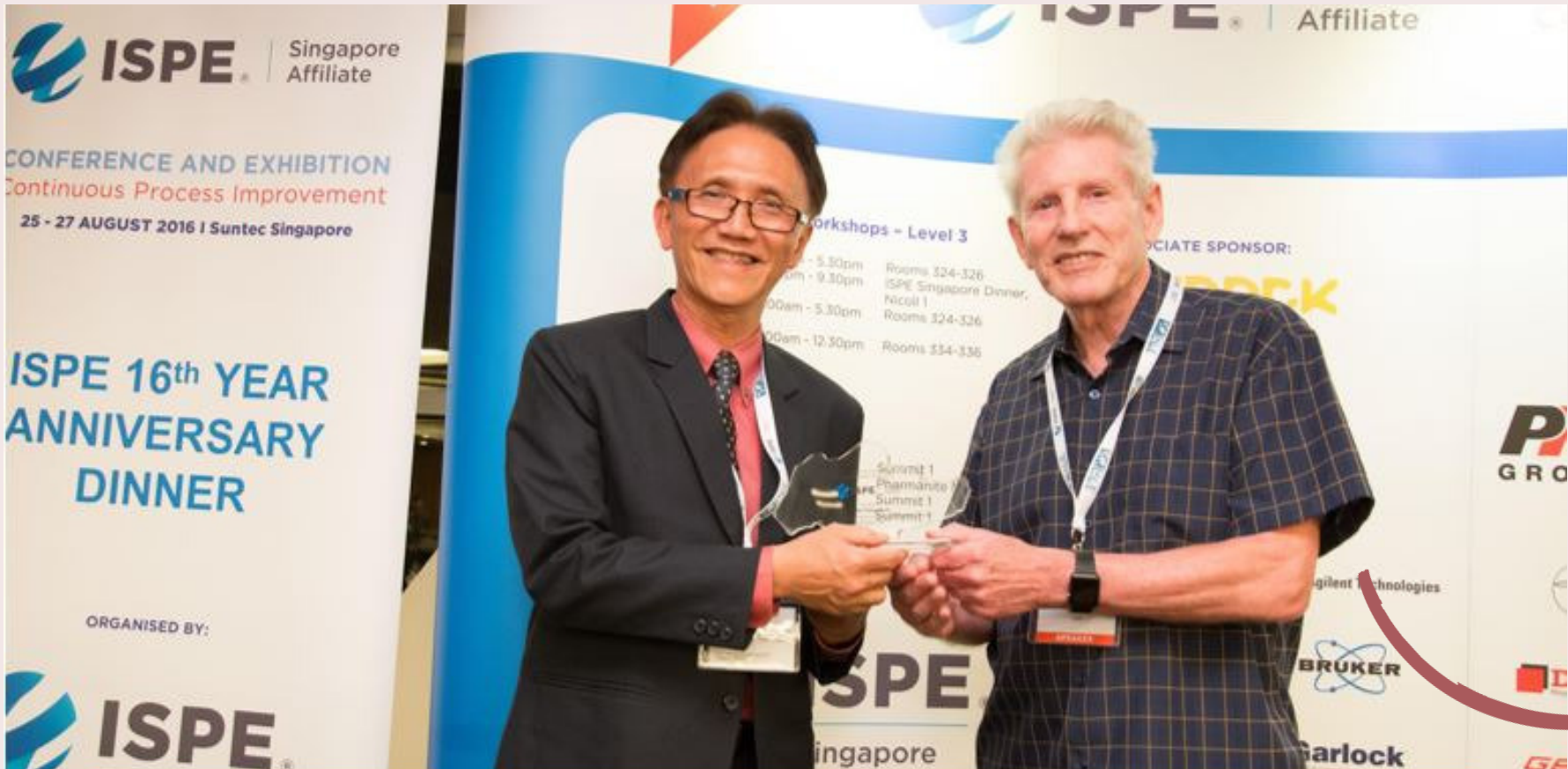
ISPE Singapore Lifetime Achievement Award 2016