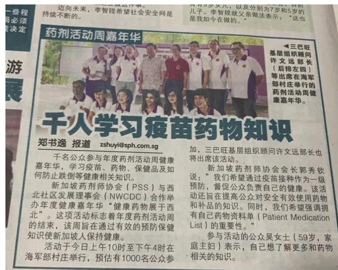
Media Coverage by Shin Min Daily News

This carnival had successfully attracted more than 1000 participants in the North West region of Singapore and the responses from the survey results showed an improvement in terms of the knowledge towards utilisation of primary prevention strategies and the management of their chronic conditions. The carnival was also covered in the press by Shin Min Daily News. We would like to thank all our volunteers, community partners as well as sponsors for their support in making this annual health carnival a success for everyone.