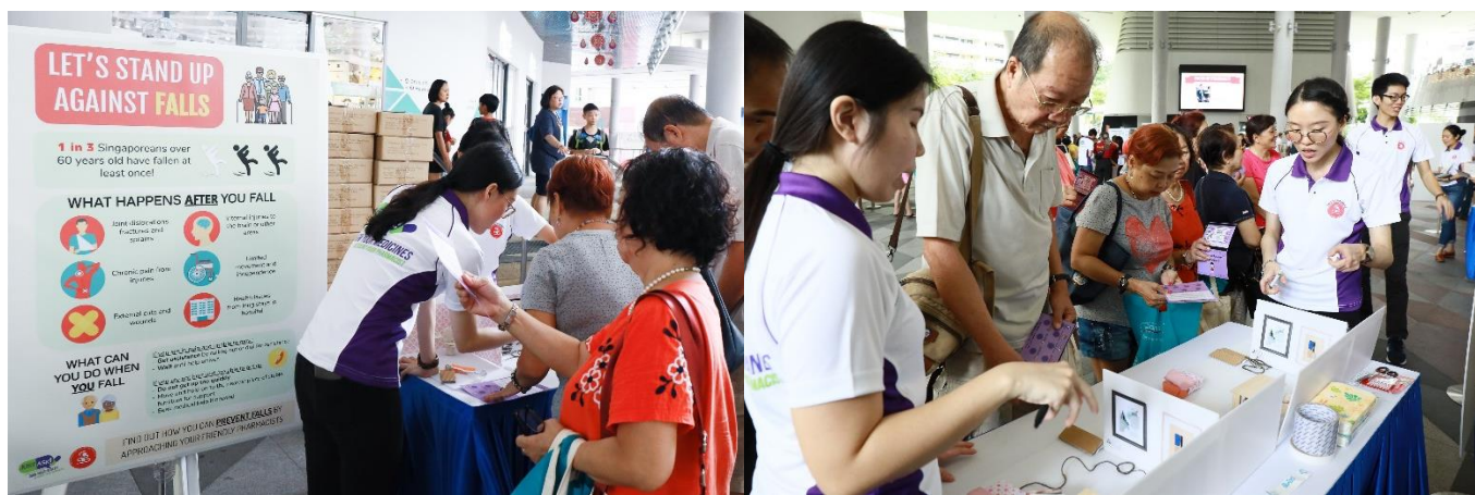
Pharmacists explaining the game concept

Members of the public sat down with pharmacists who guided them through the PML creation process, and they learned first-hand how on it should be done and the benefits of owning one. Notably, certain medications can increase the risk of falls. Falls prevention was also an important focus of secondary prevention as falls can often result in serious consequences on one's health and quality of life. Pharmacists educated the public through informative posters and engaged in an activity where they had to sort medications into those that can increase falls risk and those that did not. External risk factors of falls are also important and mini dollhouses that were done up like an average Singaporean home where participants had to identify items in that house that could potentially cause falls, tried to educate the public on that. Pharmacists then debriefed and educate the participants on these external risk factors e.g. cluttered homes that can increase fall risk and methods of fall prevention.