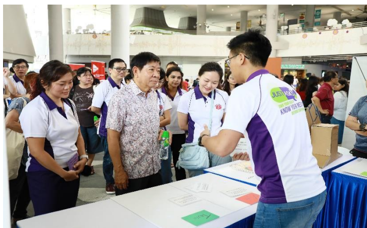
Pharmacist explaining the game concept

Members of the public sat down with pharmacists who guided them through the PML creation process, and they learned first-hand how on it should be done and the benefits of owning one. Notably, certain medications can increase the risk of falls. Falls prevention was also an important focus of secondary prevention as falls can often result in serious consequences on one's health and quality of life. Pharmacists educated the public through informative posters and engaged in an activity where they had to sort medications into those that can increase falls risk and those that did not. External risk factors of falls are also important and mini dollhouses that were done up like an average Singaporean home where participants had to identify items in that house that could potentially cause falls, tried to educate the public on that. Pharmacists then debriefed and educate the participants on these external risk factors e.g. cluttered homes that can increase fall risk and methods of fall prevention.