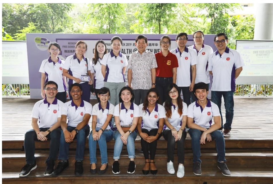
Group photograph with our Guest-of-Honour Mr Khaw Boon Wan, PSS Council Members, PW 2019 Organising Committee and President of NUS Pharmaceutical Society (NUSPS)

The main committee for PW2019 comprised of heads of the four sub-committees namely public education, publicity, sponsorship, and logistics. They had put together a series of initiatives that were rolled out in installments in the lead up to the annual health carnival that was held on the 20 th October 2019 at Kampung Admiralty. Moving on from last year's collaboration with the Central Community Development Council (Central CDC), the team decided to collaborate with the North West CDC, to continue our public education efforts in a different part of Singapore. This year, we had the honour to have Mr Khaw Boon Wan, Coordinating Minister for Infrastructure and Minister for Transport, Grassroots Adviser to the Sembawang GROs to grace the event.