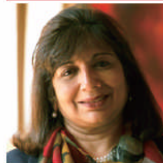
Kiran Mazumdar Shaw Chairman & Managing Director Biocon Limited, India